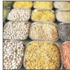
Ration to Houses