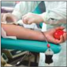
Blood Donation Camps