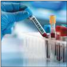
Blood Sample Collection