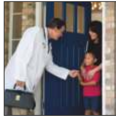
Doctor at your Door