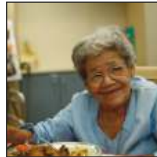
Food Distribution to Elders