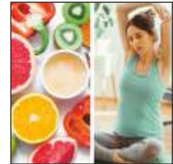
Immunity Booster Activities