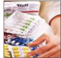
Medicine at your Door