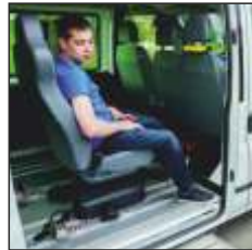
Transport to Hospital